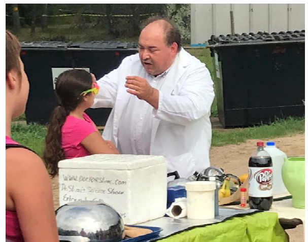
"Dr. Slime" at Community Outreach Day in Leota. MSU Extension provided nutrition education and physical activities for the kids.

MSU Extension's Supplemental Nutrition Assistance Program provides basic nutrition education and hands-on activities for all ages. Core curricula are designed to help low-income families stretch their food dollars while maintaining good nutrition. Some instruction includes physical activity and cooking techniques that help instill life-long skills. It is estimated that every $1 spent on nutrition education saves as much as $10 in long-term health costs.