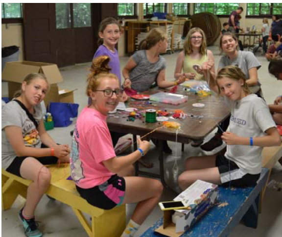
4-H campers and counselors enjoy time making friendship bracelets during Overnight Camp at Camp Neyati.

MSU Extension's team of knowledgeable financial pros demystify common financial and homeownership best practices with university-backed, research-based programs and resources to help Michigan residents navigate through challenges life throws their way. In 2018, the team provided rental education, homeowner education, financial capabilities, foreclosure counseling and Step-Forward Michigan assistance in Clare County.