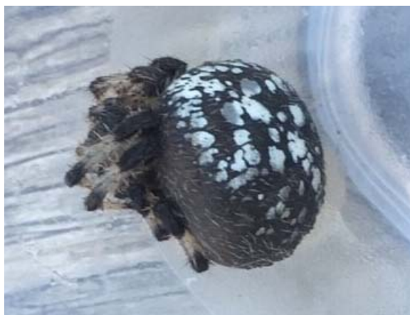
One of the many insect samples brought into the Extension office for identification.

4-H is the largest youth development organization in Michigan. Connected at the national level, MSU's program promotes the traditional 4-H clubs and fair projects, as well as many other leadership and life-skills development opportunities for youth. 4-H provides experiential learning opportunities that allow youth to explore new interests and discover their passion. In 2018, Clare County had 22 4-H clubs serving 309 youth with 60 adult volunteers. The total number of youth served in the county was 1192.