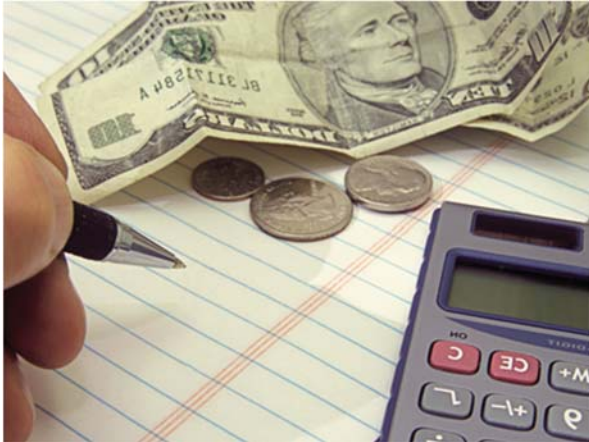
Budgeting classes help residents understand their limited resources and provide skills to help plan for homeownership.