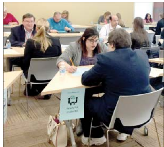
During a Mock Interview Day, youth pair up with adult volunteers and practice their interview skills.

"Mock Interview Day" offers students the opportunity to practice interview skills and network with the business community. Students are expected to bring a completed resume, job application or portfolio, and dress appropriately for an interview. Students receive individual feedback from volunteers. They become more prepared for job-seeking as a result of this experience. MSU Extension works with Clare County youth at Harrison High School to prepare for this event held annually at Mid Michigan College in Mt Pleasant.